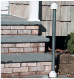
Set pipe and attach EZ Mounts