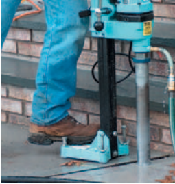
Core drill into concrete