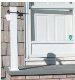
Slide vinyl posts over EZ Mounts